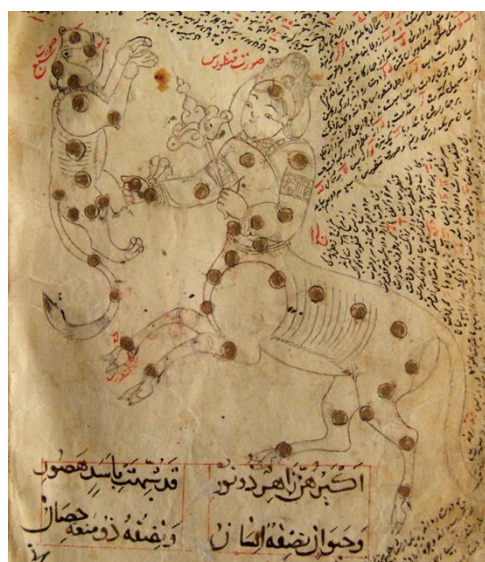
Ibn al-Sūfī, ca. 1225, probably Baghdad. Reza Abbasi Museum, M. 570, Centaurus with Lupus, p. 27.

After a re-evaluation of previous approaches, the book analyses the manuscript in detail from a textual point of view, reconstructing its jumbled sequence, and discussing its paper, inks, colours and gold, with the aid of technical analyses conducted for the first time by the British Library conservation studio. It then proceeds to consider the sources of the text within the broad framework of zoological cum medicinal works both in Arabic and Syriac, and the biographical notices we have of the Bakhtishu' family of physicians. There follows an extended discussion of the paintings, starting with the frontispieces (of which the Na't has no fewer than four) and their significance not only within this manuscript but also within Arab painting in general. The discussion of human figures is also seen in the context of the treatment of posture and gesture in manuscript painting, with parallels also from the Western tradition. Then come the animals, and relevant examples are discussed with translations of the text and analyses of the particular forms of representation chosen, while the next chapter is the core stylistic and iconographical one where a meticulous analysis of the paintings in the Na't is situated in the context of other relatable thirteenth-century manuscripts, in particular the 1224 Dioscorides and the Reza Abbasi Museum Ibn al-Sūfī.