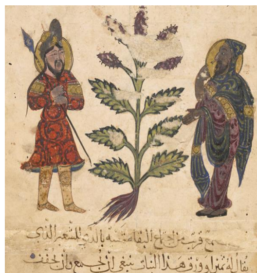
Dioscorides, dated 621/1224, probably Baghdad. Purple Betony, detached leaf in Harvard, University Art Museums, 1960.193.

Analyses conducted by a team of conservators and art historians at the Reza Abbasi Museum in Tehran have confirmed my doubts regarding the supposed twelfth-century date of the Ibn al-Sūfī, so that we can now firmly place that