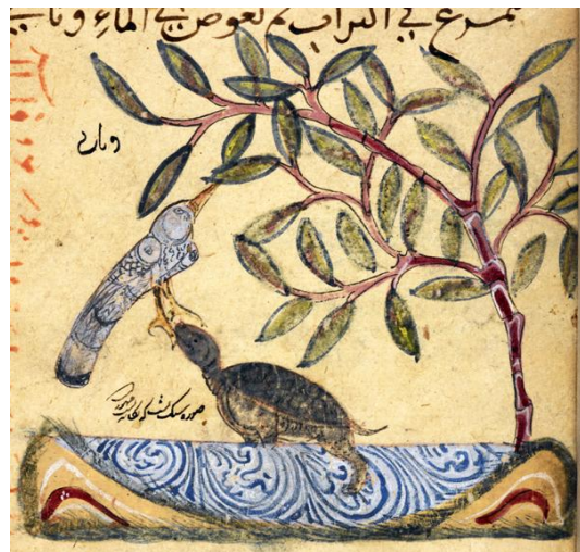
Na't – Turtle, fol. 82r.

'This is the first detailed study of an illustrated bestiary from the Islamic world. It sets this 13th-century Arab manuscript squarely within the context of both the Islamic tradition of animal lore and of classical and medieval Christian learning in this field. It is also a meticulous investigation and analysis of the art-historical aspects of this masterpiece of Islamic book painting. As such it is a pioneering and erudite contribution to Islamic art and literature alike.'